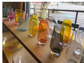
Penn + Fairmount glasses, pitchers and bowls that are made at PGC.