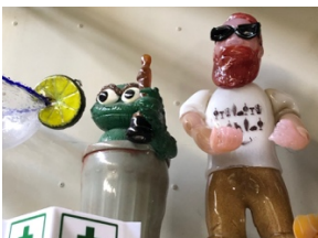
Blown glass sculptures made during a recent Hot Jam glassblowing demonstration at PGC.