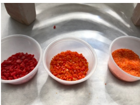
Crushed colored glass called Frit that used for glassblowing and fusing.

We took ourselves on a scavenger hunt at our PGC home and here are some of our favorite findings: