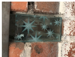
This is a hidden engraved glass brick left behind by a visiting glass artist.